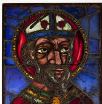
Head of an Apostle (detail) Modern, in 12th century style, German, stained glass, 1930.29

Inspired by the switch-up of colors and the white crayon’s writing on black paper in the book “The Day the Crayons Quit”, we will create a “stained glass” abstract self portrait! There is an example of a person’s face made in stained glass to the left, and the piece “Sunset” on the inspiration artwork page is a good example of a painting inspired by stained glass.